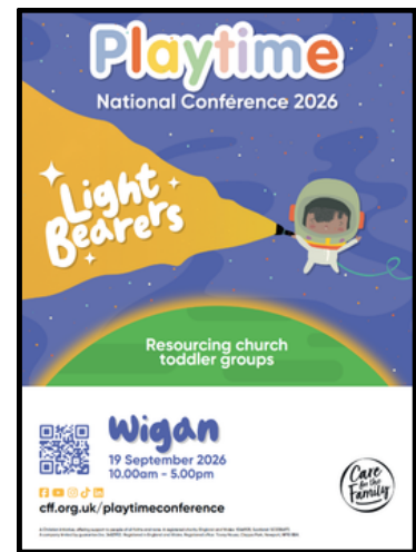
Poster This is for any notice boards/advertising spaces. Type the details of your event in the box and print.