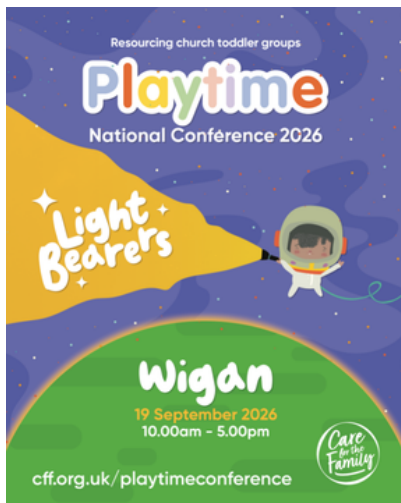
Social media post This can be posted on your chosen social media feed.