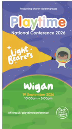
Story post Use this on Instagram and/or Facebook stories.